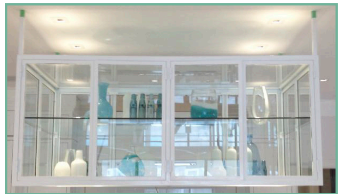
Stainless Steel Ceiling Hung Glass Cabinet