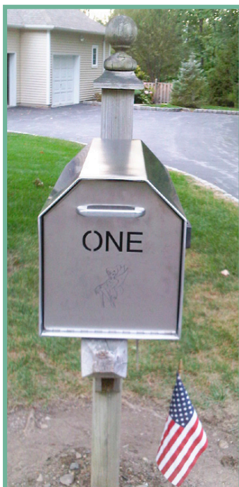
Stainless Steel Standard Mailbox