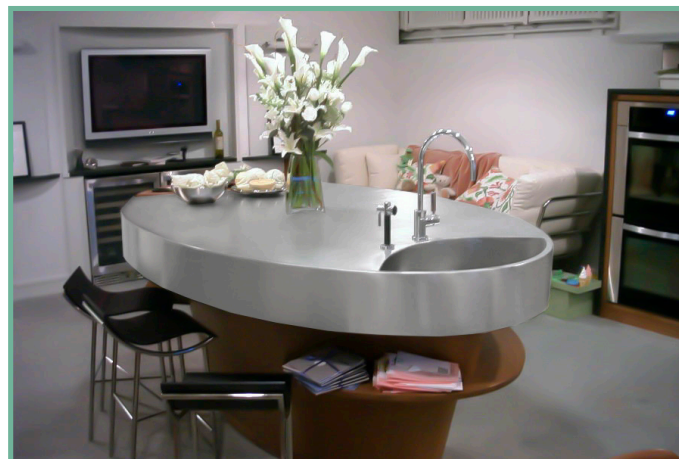
Stainless Steel Island Table w/ Integrated Sink

Breathe life into your existing kitchen setup by incorporating functional stainless steel islands into your decor. Customizable to fit your needs.