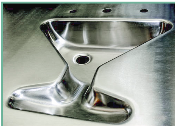
Custom Martini Shaped Sink Bowl

Personalize your kitchen experience with custom stainless steel sink bowls. Custom S/S sink bowls are exceptional workstations, designed for cutting down on clean up & prep times.