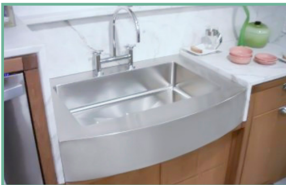
Stainless Steel Euro Type Sink

Euro type sinks add an extra flair & elegance to your setup. The contemporary bowl design is perfect for a kitchen or outdoor countertop.