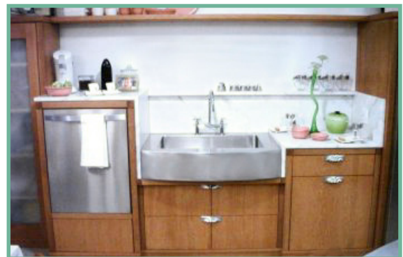
Stainless Steel Euro Type Sink