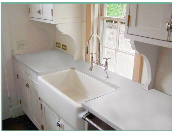
Stainless Steel Countertop Modification

The quickest & best way of bringing a professional vibe to your home is by incorporating beautiful, restaurant style stainless steel countertops.