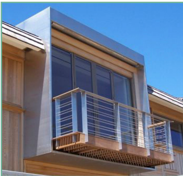
Stainless Steel Balcony Modification