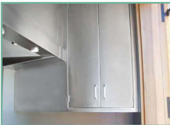
Stainless Steel Wall Cabinet Installed in East Hampton, NY

Give your home a modern look with stainless steel storage cabinets. Easy to clean & durable, S/S cabinets give your small or large items a new home. Storage, wall & base cabinets are available.