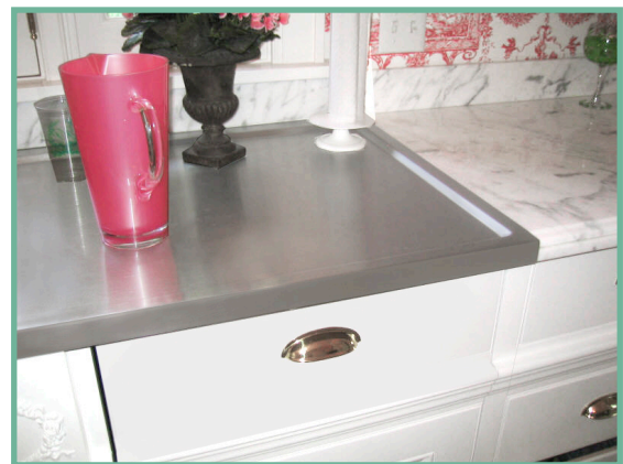
Stainless Steel Countertop Modification