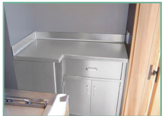
Stainless Steel Base Cabinet w/ Countertop Installed in East Hampton, NY