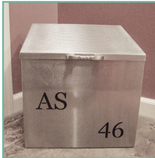
Stainless Steel Hinged Door Mailbox

Stainless steel mailboxes give a sleek & contemporary appearance to complement your home decor. They are also corrosion & rust resistant, so they can easily stand up to the elements.