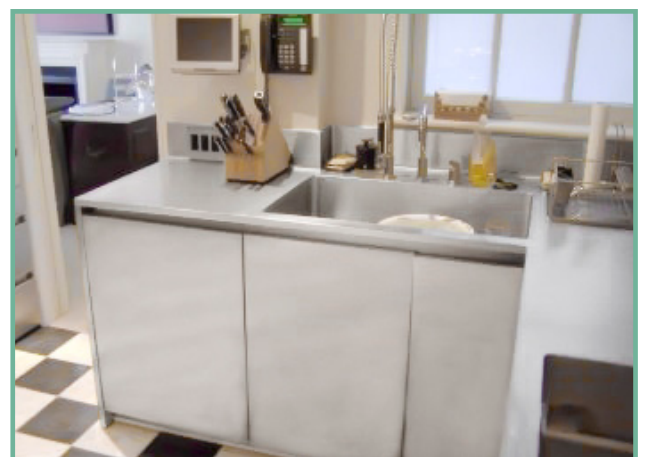
Stainless Steel Sink Cabinet