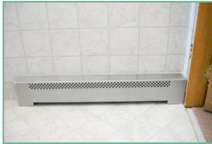
Stainless Steel Heater Cover

Rejuvenate your ugly, old baseboard heater covers with stainless steel. Simply slip onto the existing baseboard heater to give your room new life.