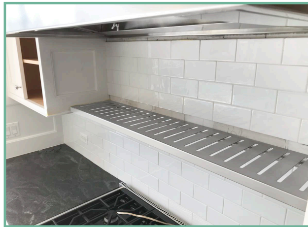
Stainless Steel Louvered Wall Shelf

Add an extra touch of storage (& beauty) above kitchen sinks, counters or prep areas. Customizable widths & lengths to accommodate your area.