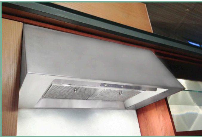
Stainless Steel Hood Vent

Our job is to turn your design dreams into reality with handcrafted pieces custom designed to your specifications. Here's a look at some other completed residential projects: