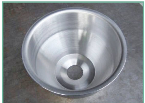
Custom Wine Bowl