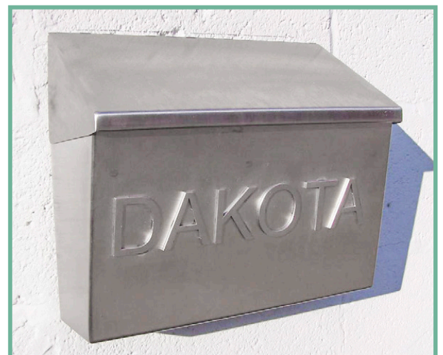
Stainless Steel Wall Mounted Mailbox